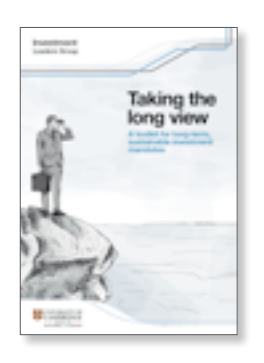
Guidance on the characteristics of mandates that encourage long-term, sustainable investment management.