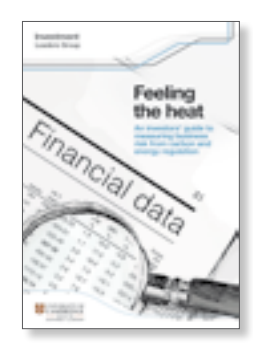
Assessment of the impact of carbon-related regulation on asset profitability.