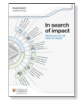
A framework to help investors measure and communicate their contribution to sustainable development.